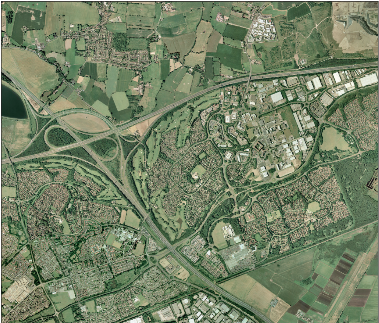
Figure 2: A vertical air photograph of part of a rural-urban fringe in the UK